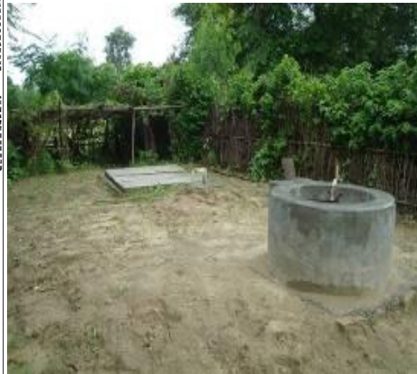
Fig: Biogas Digester in Operation