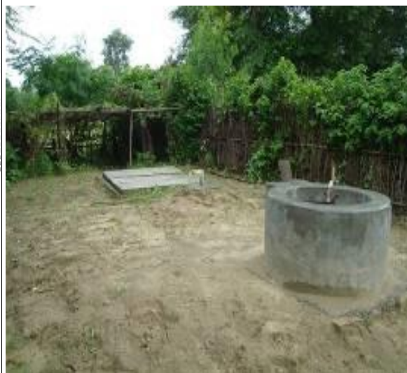
Fig: Biogas Digester in Operation