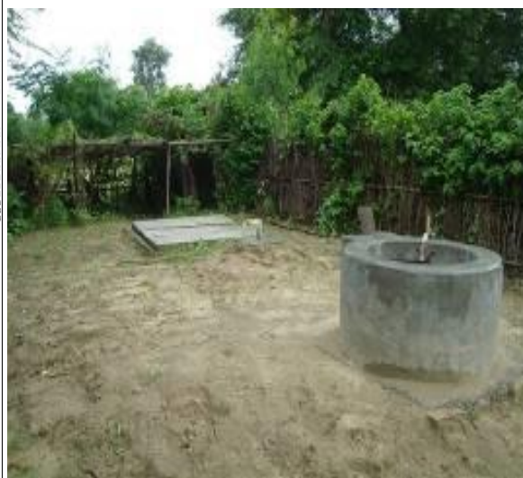
Fig: Biogas Digester in Operation